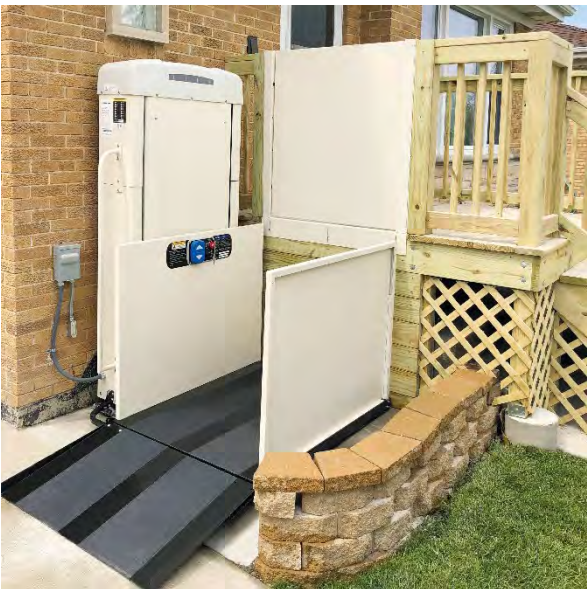
Vertical Wheelchair Lifts