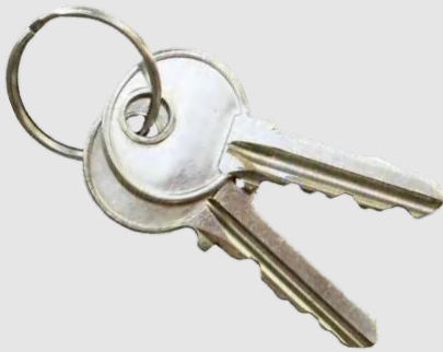
Available Key Locks Prevent Unauthorized Use