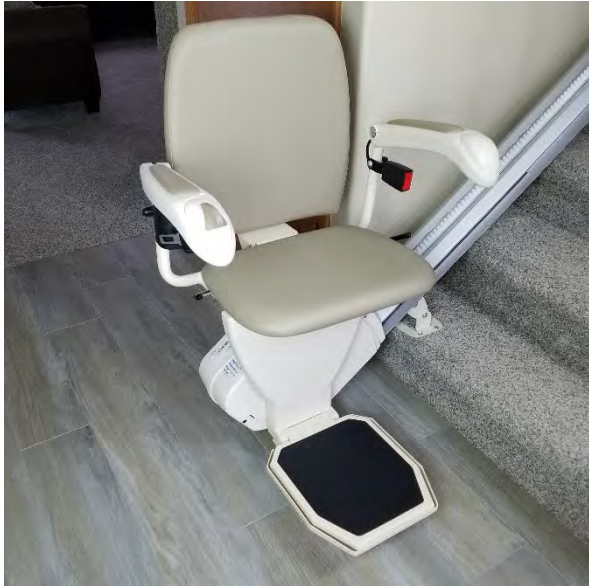
Straight Stair Lifts