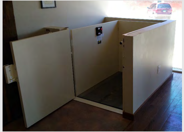
Automatic doors & gates available to meet ADA requirements.

Guardian LED Diagnostic System allows for confident operation and simplified troubleshooting.