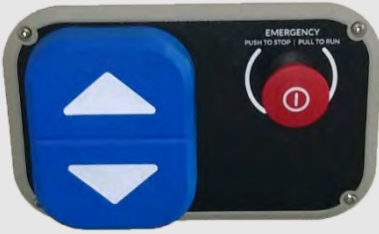
Easy to Operate Controls