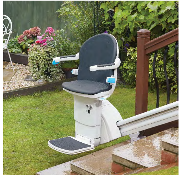
Outdoor Stair Lifts