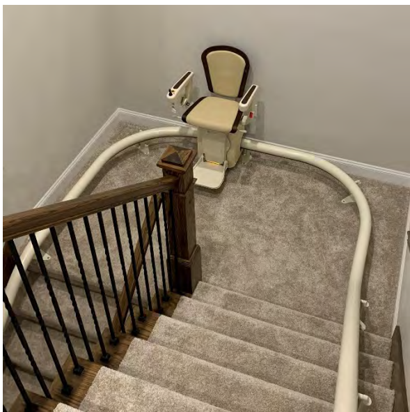
Curved Stair Lifts