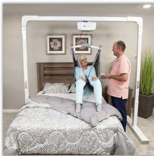
Free Standing & Portable