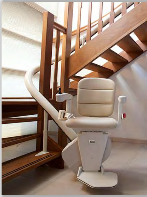
Curved Stair Lifts