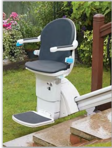
Outdoor Stair Lifts