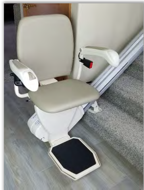
Straight Stair Lifts