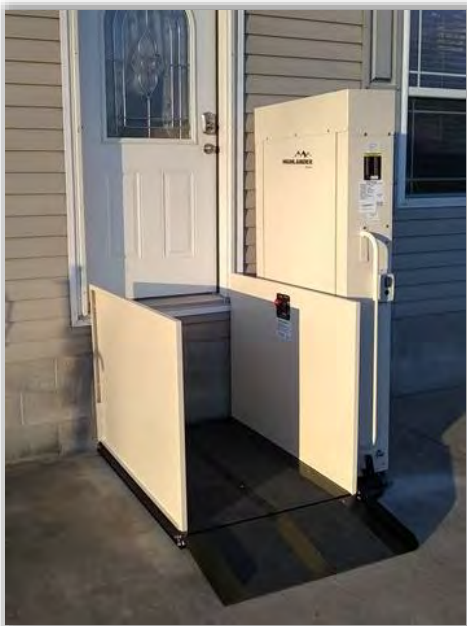
Vertical Wheelchair Lifts