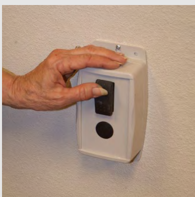
Optional Call/Send Controls

Guardian LED Diagnostic System allows for peace of mind and simplified troubleshooting.