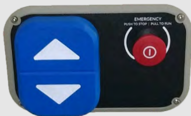
Easy to Operate Controls