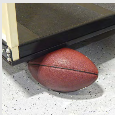
Obstruction Sensors for Safe Operation