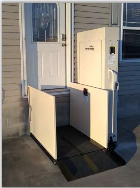
Vertical Wheelchair Lifts