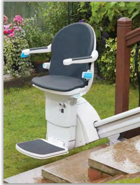
Outdoor Stair Lifts