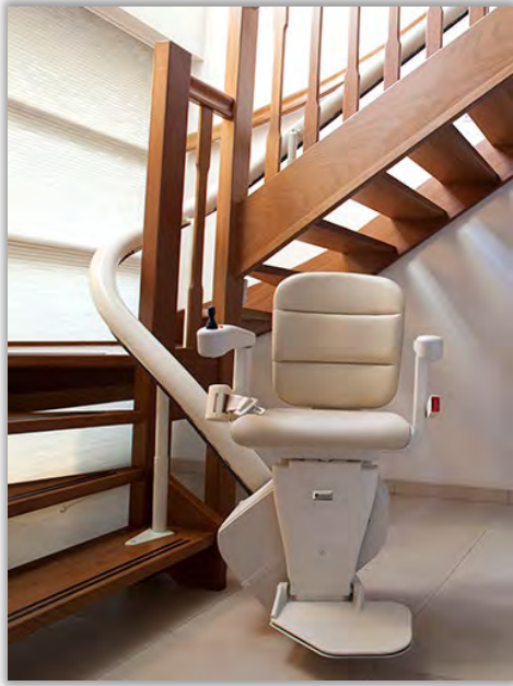
Curved Stair Lifts